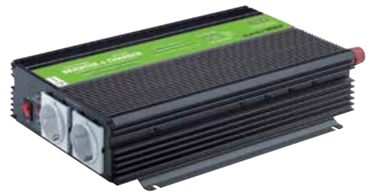
INVERTER + CHARGER MODIFIED WAVE XUNZEL 1200W/12V

12VDC TO 230VAC INVERTER AND 12VDC BATTERY CHARGER