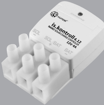
NANO SOLAR CHARGE CONTROLLER