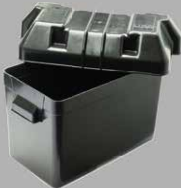
XUNBOX™ Series - XUNZEL