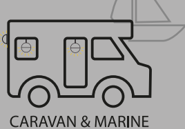
CARAVAN & MARINE