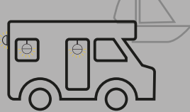
CARAVAN & MARINE