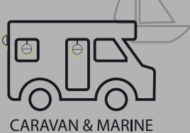
CARAVAN & MARINE