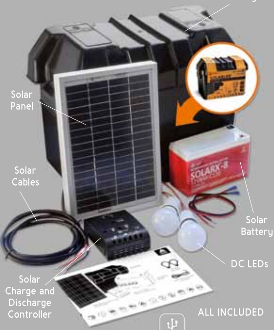
Universal Battery Box